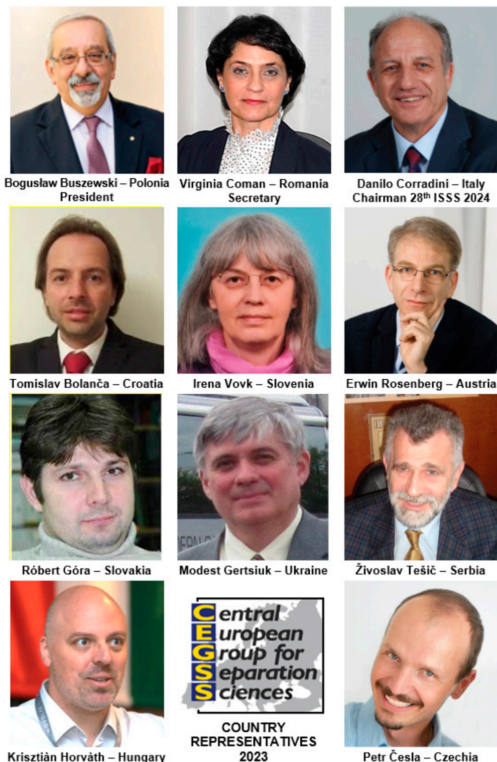
Figure 9. CEGSS Steering Committee in the year 2023.